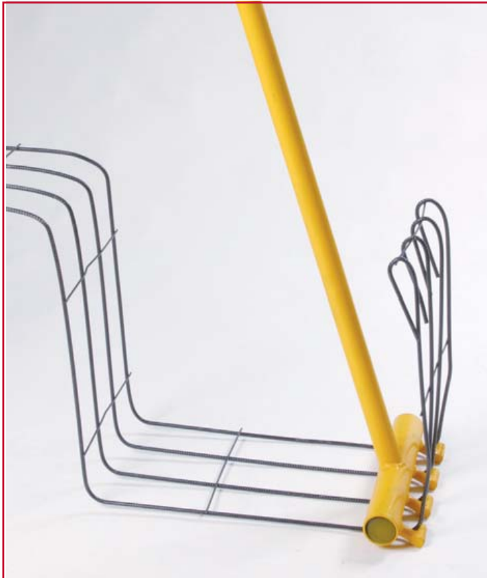
Trench Mesh Bender